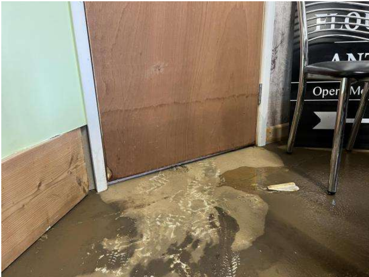
The damage caused by the flooding