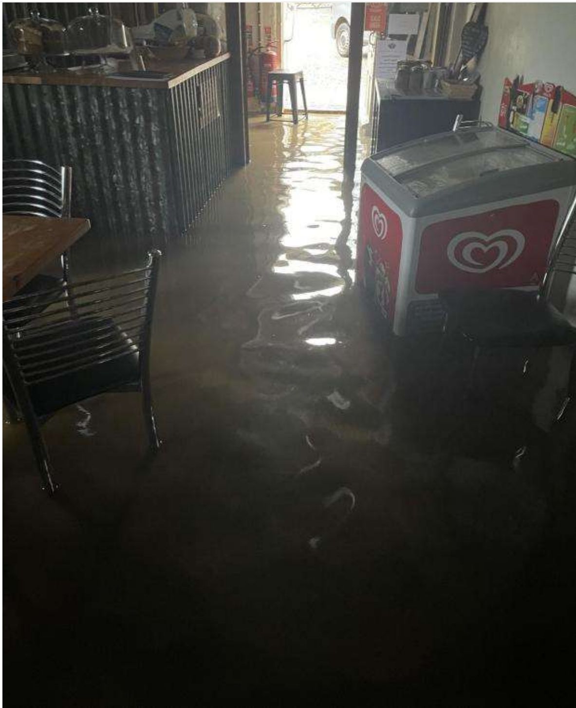
The flooding at Letheringsett Watermill