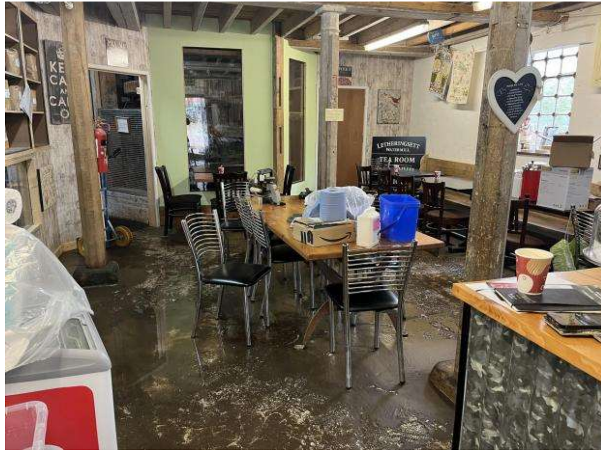
Inside Thurlow tea room at Letheringsett Watermill