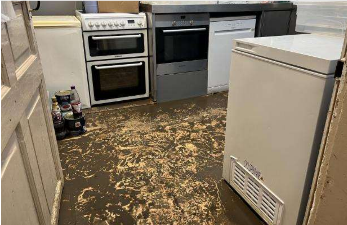
Inside the kitchen of Thurlow tea room at Letheringsett Watermill